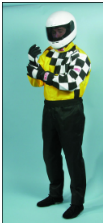
Pro Series Style S Suit